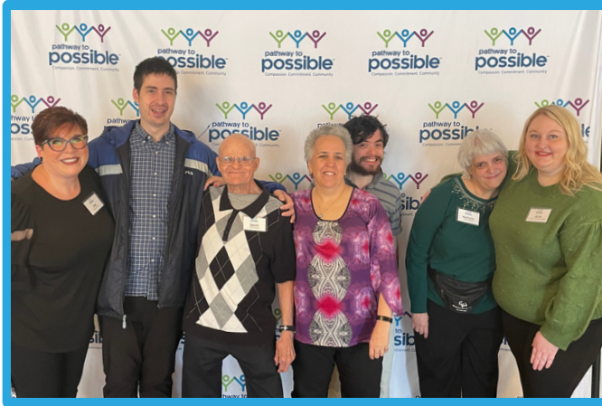
P2P staff members & Independent Living Program clients pose at our Annual Friends & Family Breakfast