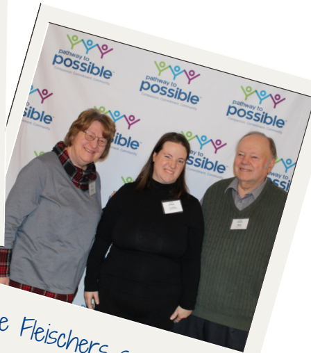
The Fleischers say cheese!