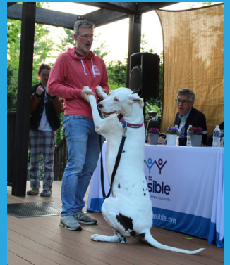
Boo performing in P2P's Community Dog Show