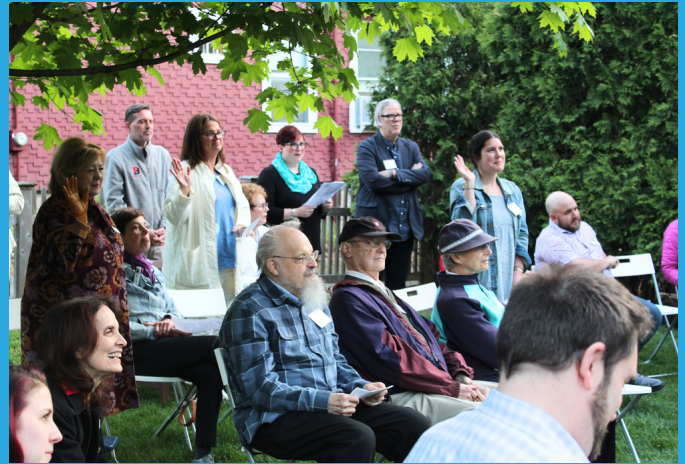
Swearing in our FY24 Board of Directors.