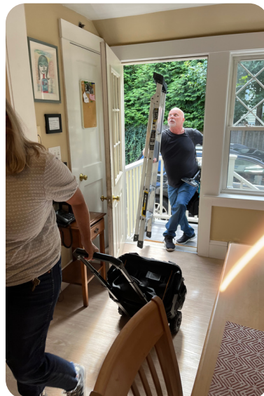
The kitchen windows getting ready for their close up.