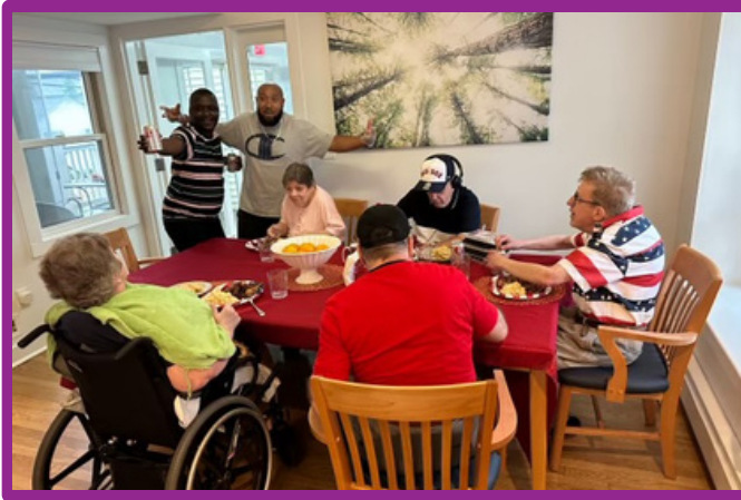
All smiles at one of Webster House's infamous BBQ dinners!